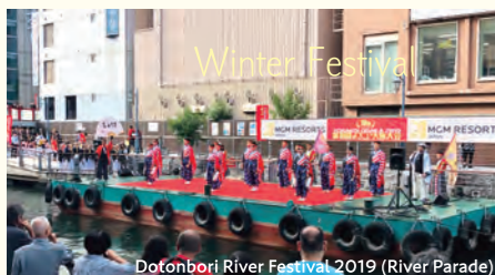
Dotonbori River Festival 2019 (River Parade)

Please check the holding information on the website.