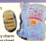
Illumination of lucky charm from Ebisubashisuji shopping street

In addition to lights and decoration along Midosuji street, illuminated objects will be displayed at commercial buildings in Minami area.