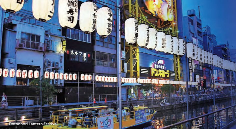
Dotonbori Lantern Festival