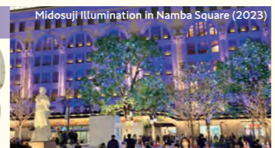
Midosuji Illumination in Namba Square (2023)