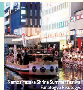
Namba Yasaka Shrine Summer Festival Funatogyo Rikutogyo

You can enjoy unique summer festivals, feeling traditions of shrines and temples which have a deep connection with Minami. Namba Grand Shrine, Ikukunitama Shrine Ikutama Festival / Namba Yasaka Shrine Summer Festival Funatogyo Rikutogyo / Mitsu Hachiman Shrine Summer Festival / Naniwa Kozugu Shrine Grand Festival / Namba-Jinjya (Shrine) Himuro Festival / Imamiya Ebisu Shrine Children's Ebisu